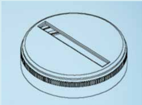
CAD drawing to realize shape and proportion

Implementing our expertise, Starplex produced a market-ready product from concept to full scale production.