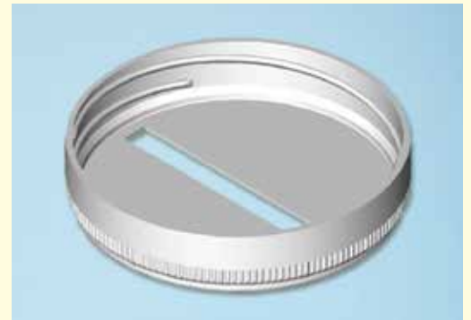
3D rendering for preparation for 3D printer