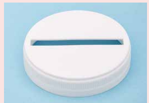
Final market-ready product