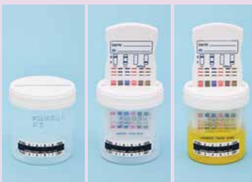
Testing of container, cap and dip card